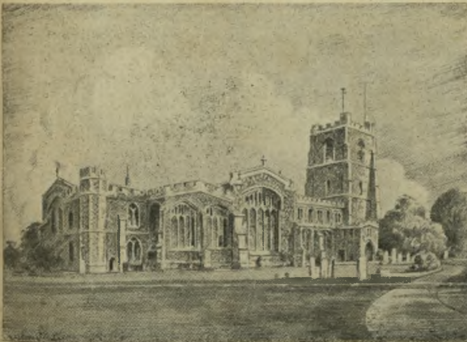
THE PARISH CHURCH OF ST. MARY, LUTON.