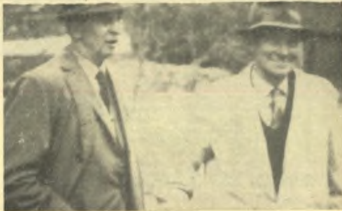
Two ringers from the Cotswolds who were interviewed.