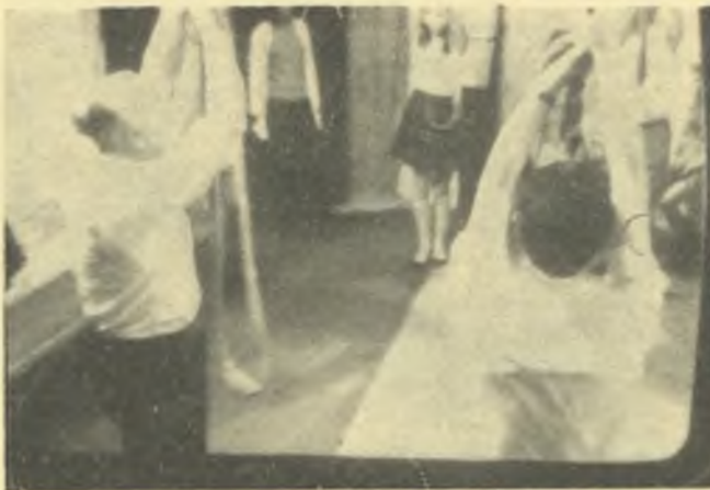
Ringers of St. Mary's, Harrow-on-the-Hill, who rang Grandsire Triples.

We catch the rapture and we spread it forth."