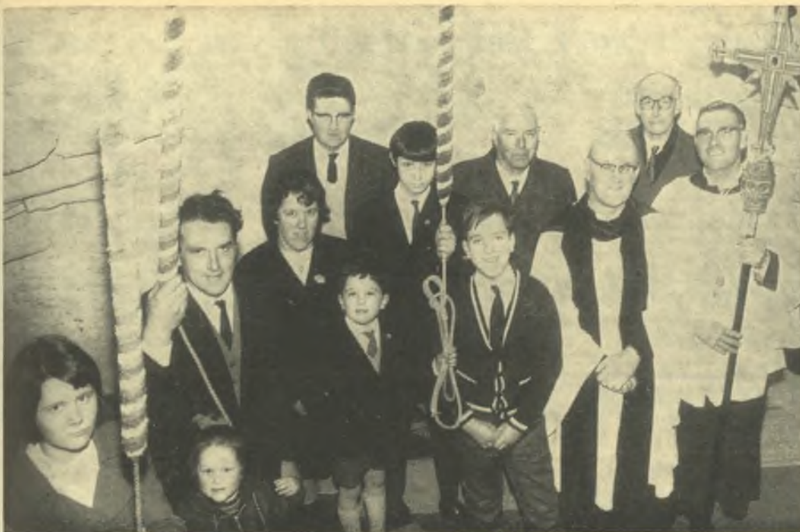
Ringers of St. Nicholas Church, Grosmont, Abergavenny, Monmouth.