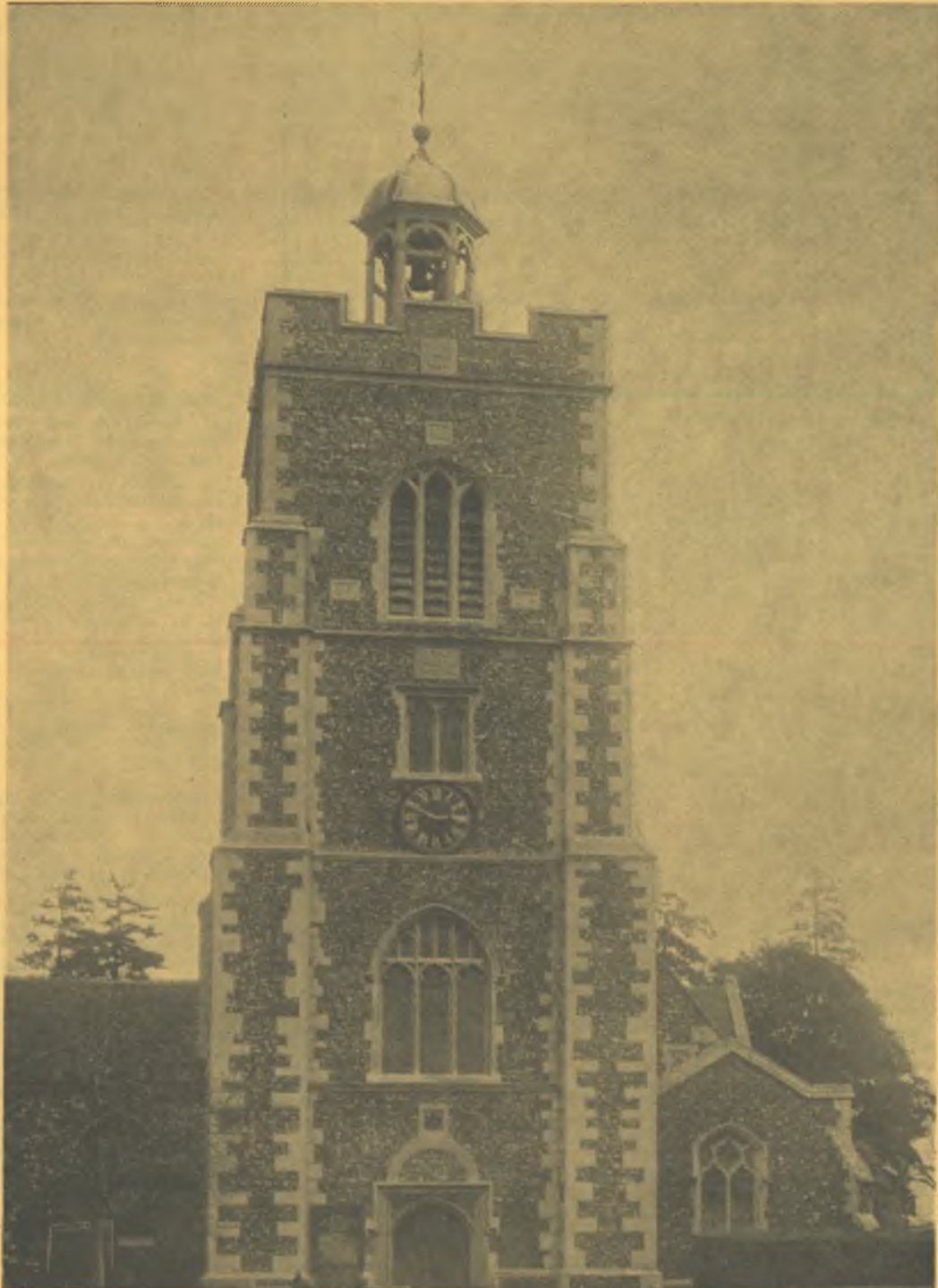
St. John-the-Baptist's, Hillingdon, Middlesex