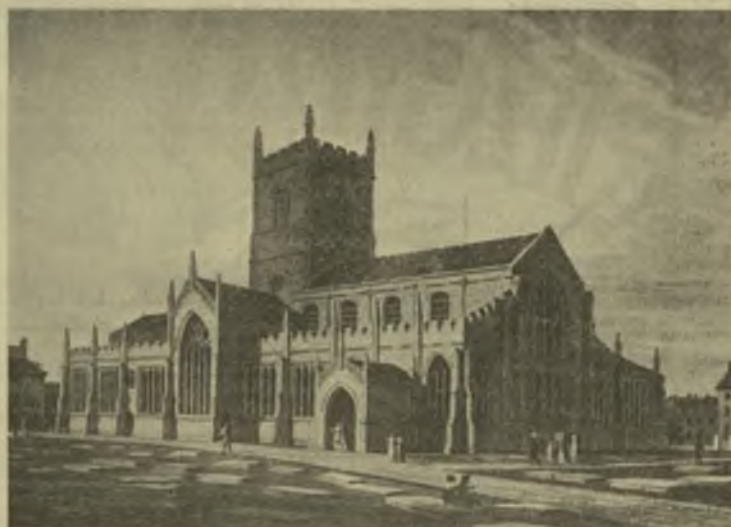
LEEDS OLD PARISH CHURCH

Although there are accounts of the Leeds company taking part at the openings of new rings over a wide area—even at St. Cuthbert's, Darlington—surprisingly there is no mention of the visit to Aberdeen in 1858 to open the ring at St. Nicholas', as mentioned on page 732 and the leading article on Dec. 6th, 1963, for this must have been quite an event and must surely have been fresh in the mind of the compiler of the records from which I quote.