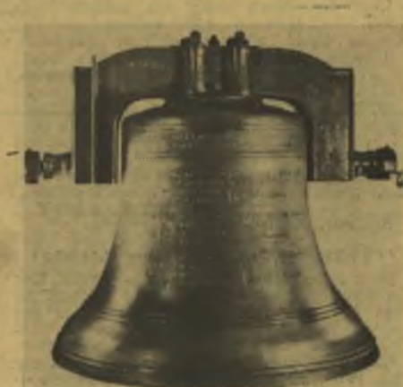
Sherborne Abbey tenor, recast in 1933 by Whitechapel Foundry, is inscribed: 'By Wolsey's gift I measure time for all. To mirth, to grieffe, to church I serve to call.'