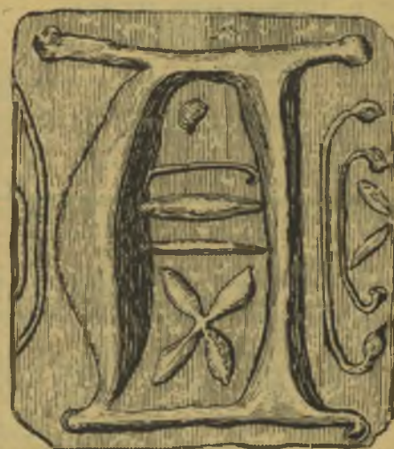
An example of lettering from the Bury Foundry