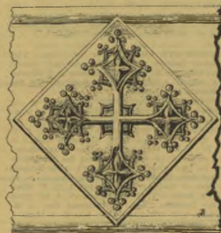
A Bury Bell Stamp

The following is the will of Thomas Chyrch, dated July 12th, 1527: