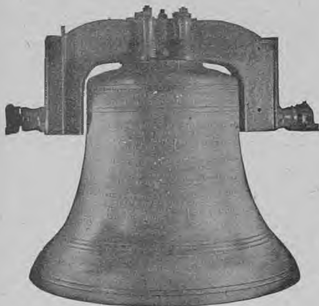
SHERBORNE ABBEY RECAST TENOR.