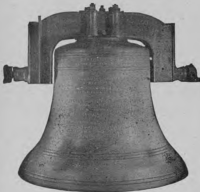
SHERBORNE ABBEY RECAST TENOR.