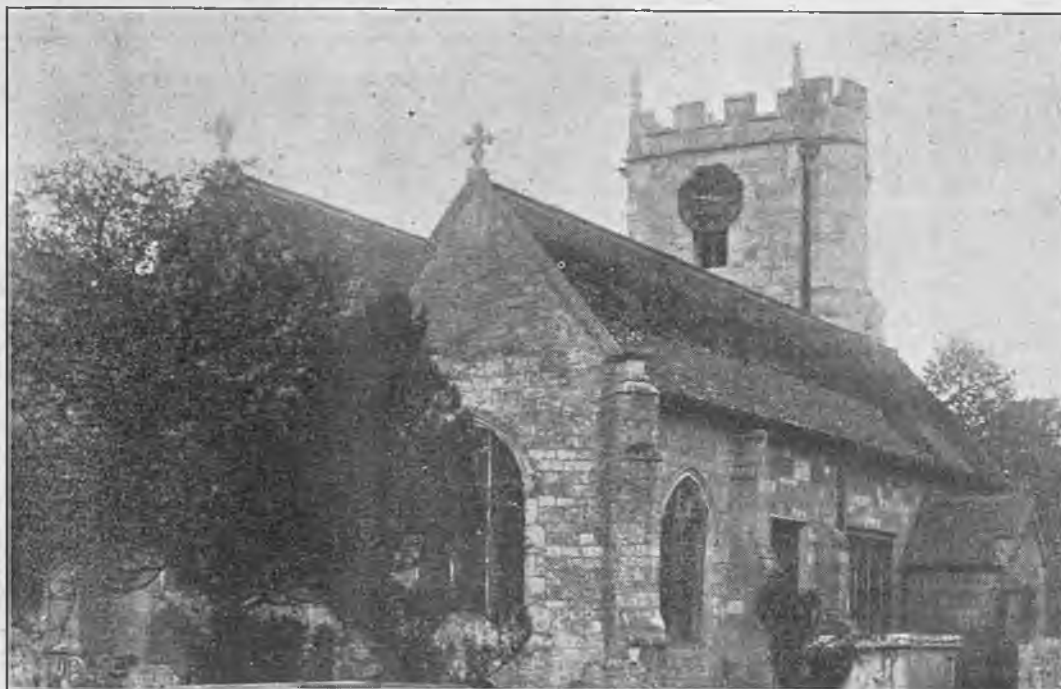
NORTH STONEHAM CHURCH AND TOWER, SHOWING THE VERY OLD ONE-HAND CLOCK.

North Stoneham now possesses one of the lightest rings of ten in the country. The peal at Loughborough Foundry, with a 6½ cwt. tenor, is the smallest. Cudham, in Kent, has another very light peal, and North Stoneham, with a tenor of only 9 cwt. 26 lb., comes next.