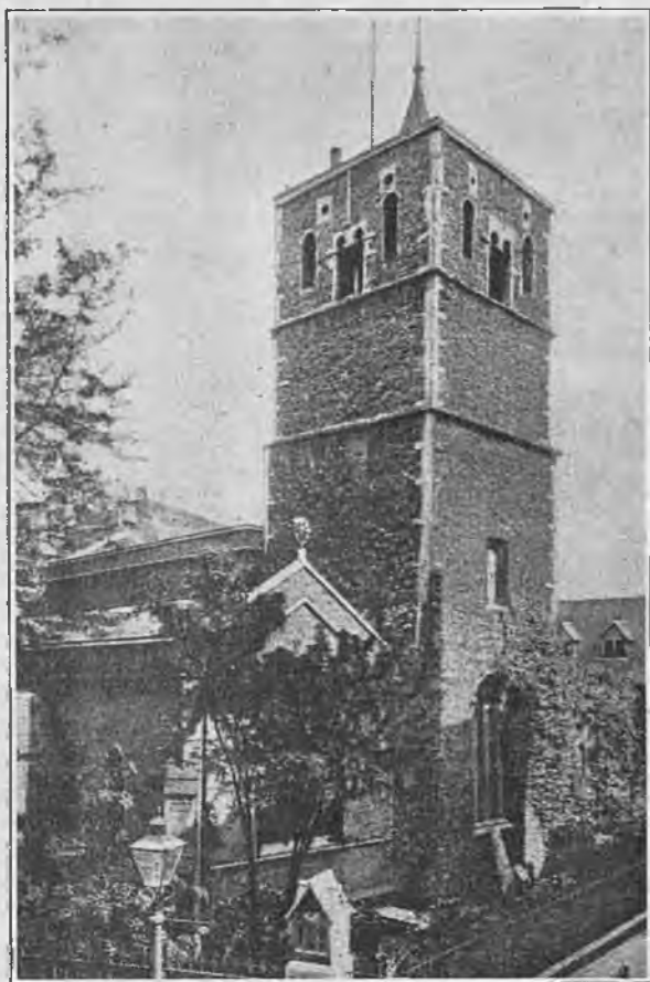
ST. BENEDICT'S, CAMBRIDGE.

There is a special interest to ringers in the tower and bells of St. Benedict's Church, Cambridge, for it was here that Fabian Stedman rang and developed in Doubles the method for ever associated with his name. It was Stedman who first really visualised the possibilities of half-pull change ringing as it is practised to-day, and although he was probably not the originator of the system, which came by the process of evolution, it was he who really gave it the first great push that sent it on its ever-expanding course.