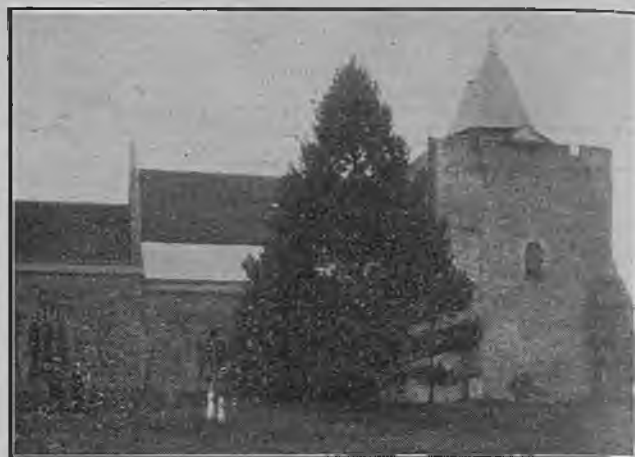
ST. NICHOLAS' CHURCH, LEEDS, KENT.