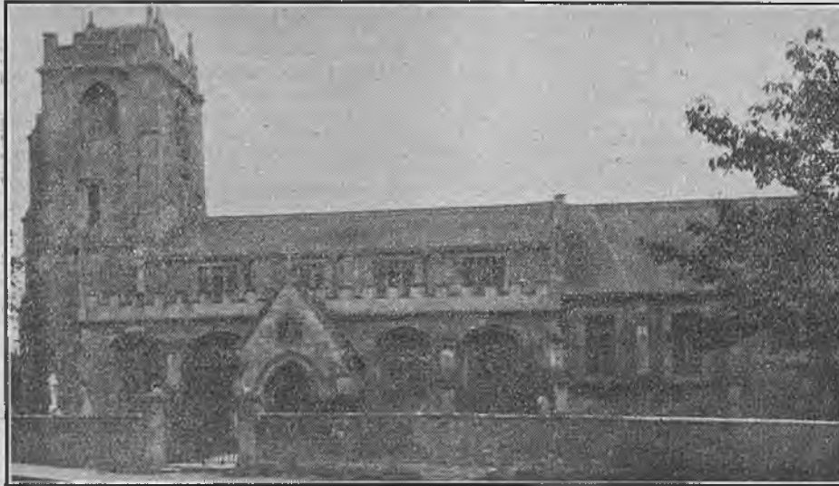
THE CHURCH OF ST. KATHERINE, HOLT, WILTS.