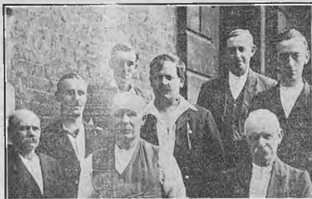
THE EIGHT EDWARDS.