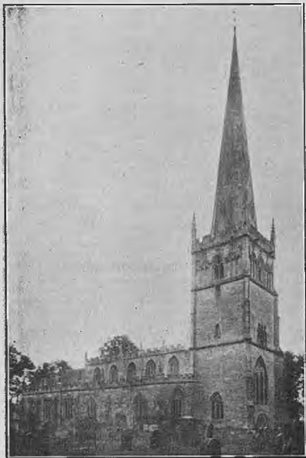
ST. JOHN-THE-BAPTIST CHURCH, BROMSGROVE.

Made eight in 1773, the first recorded peal on the bells was on December 31st, 1787, when 'a compleat peal of Bob Major, 10,192 changes,' was rung in 6 hrs. 33 mins. In December, 1788, a peal of 12,000 Bob Major (of which the composition is preserved) was