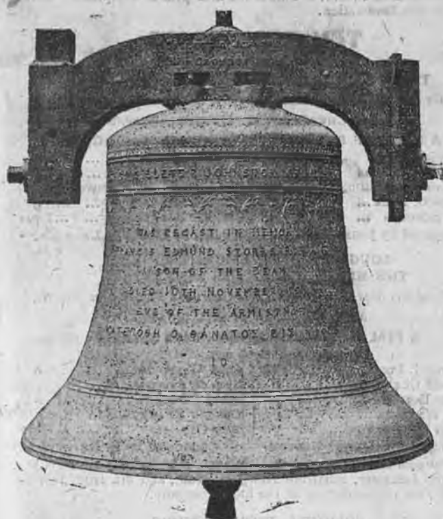
The Recast Tenor (30 cwt.) at ROCHESTER CATHEDRAL.