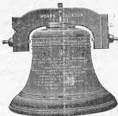
Tenor Bell, 25½ cwt., of the new ring of Ten at St. Peter's, Brighton.