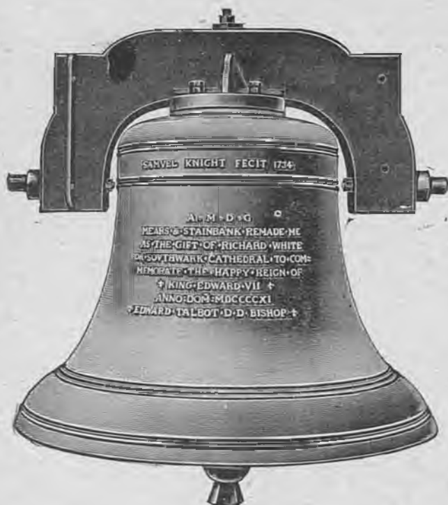
THE TENOR BELL, SOUTHWARK CATHEDRAL, Weight, 50 cwt, 0 qr. 21 lbs.

Bellfounders & Bellhangers, 32 & 34, Whitechapel Road, LONDON, E.