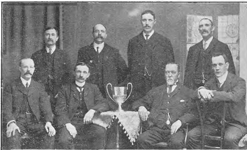
The Brighthouse company who won the Halifax and District Association's Competition on February 10th.